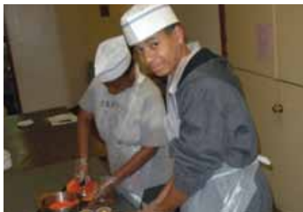
Left to right: GO Project, Grace Church, Manhattan; St. Michael's Outreach, Manhattan