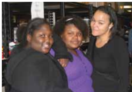
Left to right: Amazing Grace Circus!, Grace Church, Nyack; Caring Hands Food Pantry, St. John's Church, Monticello