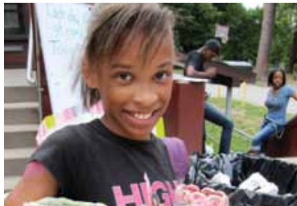
Left to right: Feeding Ministries, Christ Church, Suffern; Christ Church Summer Camp, Poughkeepsie