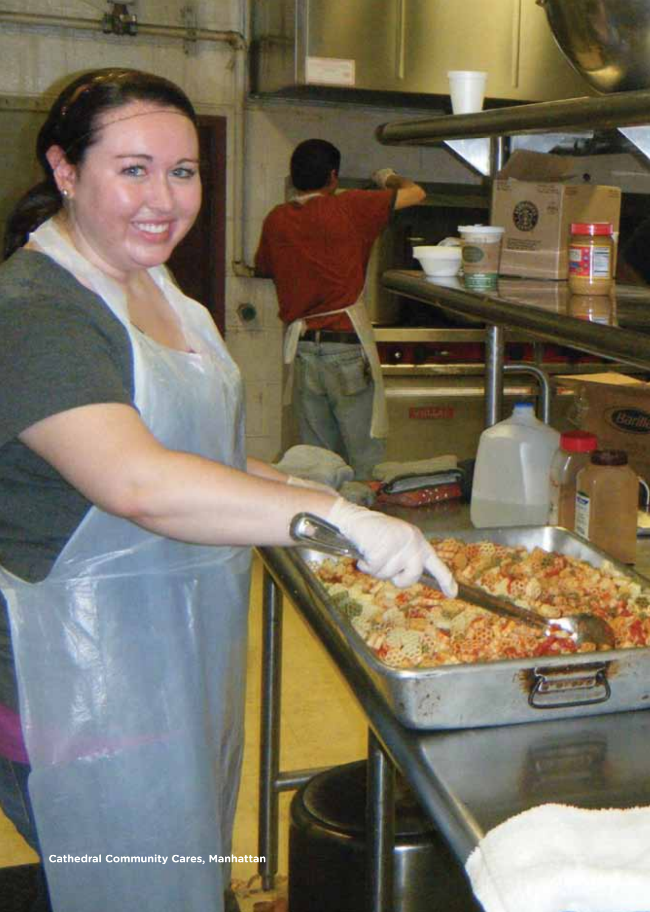
Cathedral Community Cares, Manhattan