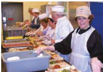
Left to right: Grace Church Summer Camp, White Plains; Holy Apostles Soup Kitchen, Manhattan