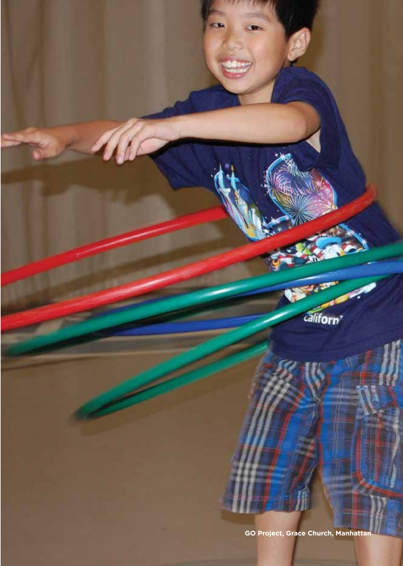
GO Project, Grace Church, Manhattan