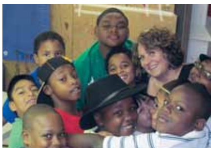
Photo captions from left to right: St. Andrew’s Day Program, Hartsdale; Christ Church Summer Camp, Poughkeepsie