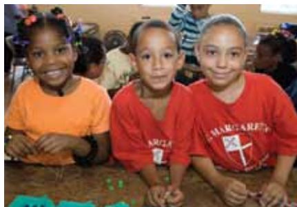
Photo captions from left to right: Peace Zone, Bronx; St. Margaret's Summer Camp, Bronx