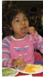
Photo captions from left to right: Young at Arts, Christ Church Bronxville; San Andres After School, Yonkers; St. Peter's Learning Center, Port Chester; St. Margaret's Feeding Ministry, Bronx

“Through Episcopal Charities we are a part of a vital program of generosity and caring reaching far beyond our small town.”