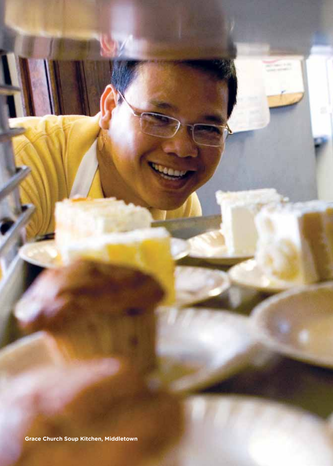
Grace Church Soup Kitchen, Middletown